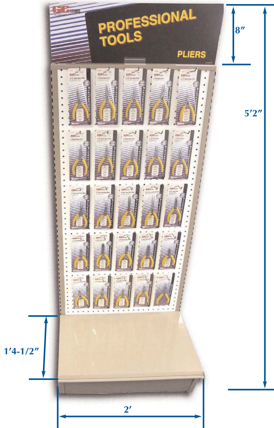
Display Rack Part No.49-1908

Program Dimensions: 2'w x 5'2"h x 1'4-1/2"d