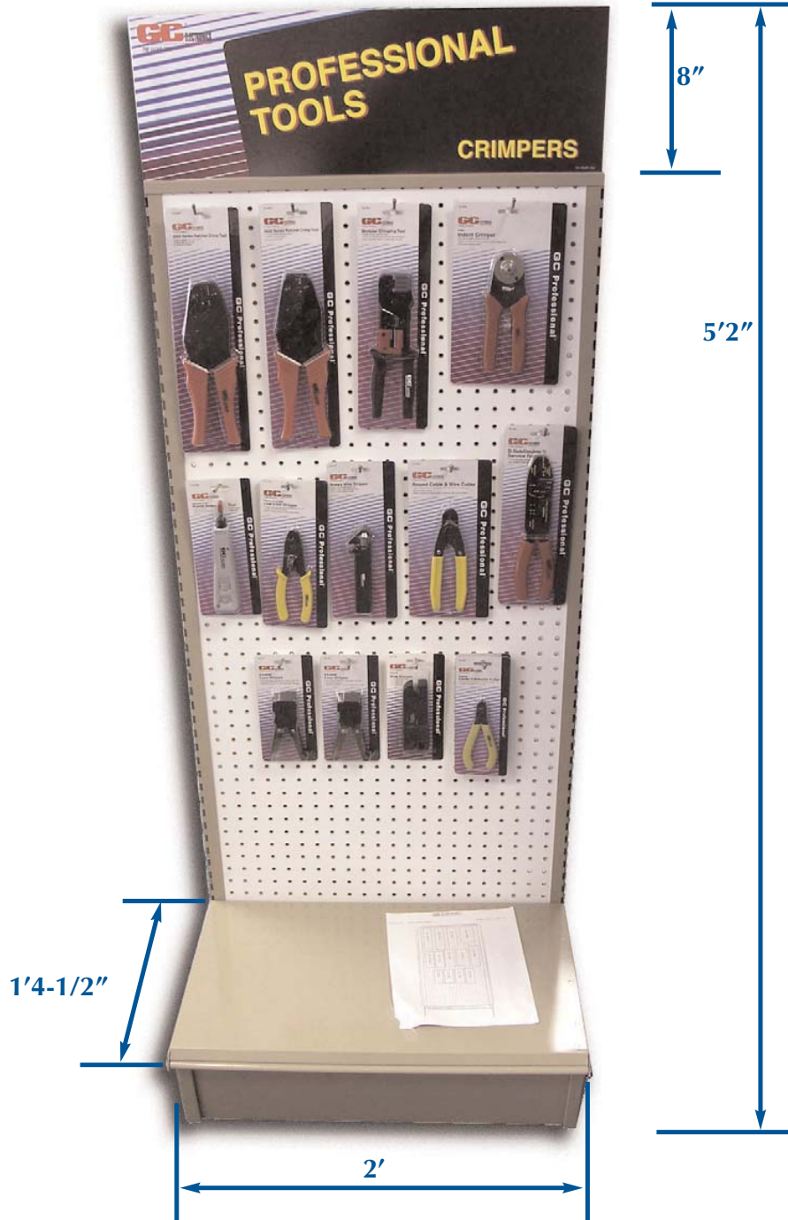
Display Rack Part No.49-1940

Program Dimensions: 2'w x 5'2"h x 1'4-1/2"d