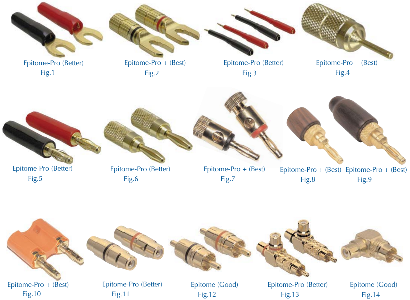
Epitome-Pro (Better) Fig.1